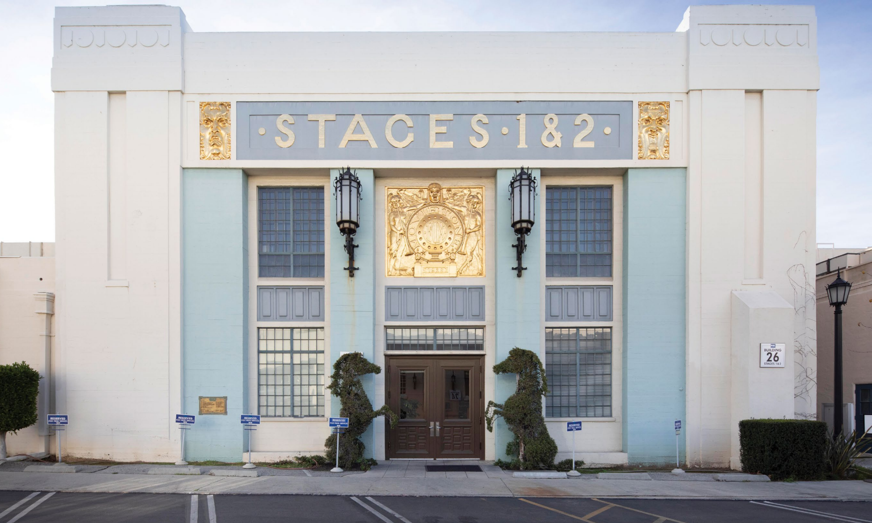
The entrance to the Fox Scoring Stage.

section, supplemented with virtual instruments. They can be done with a solo cello in a Berlin home studio. They can be done in Seattle or Salt Lake or Charlotte. Plenty of high-quality, high-end videogame scores are done at Ocean Way in Nashville. But few places can host the city philharmonic and reliably deliver quality recordings for a theatrical blockbuster or Grammy-winning Best Classical Recording, while under the constant pressure of thousands and thousands of dollars an hour, with zero downtime save union breaks.