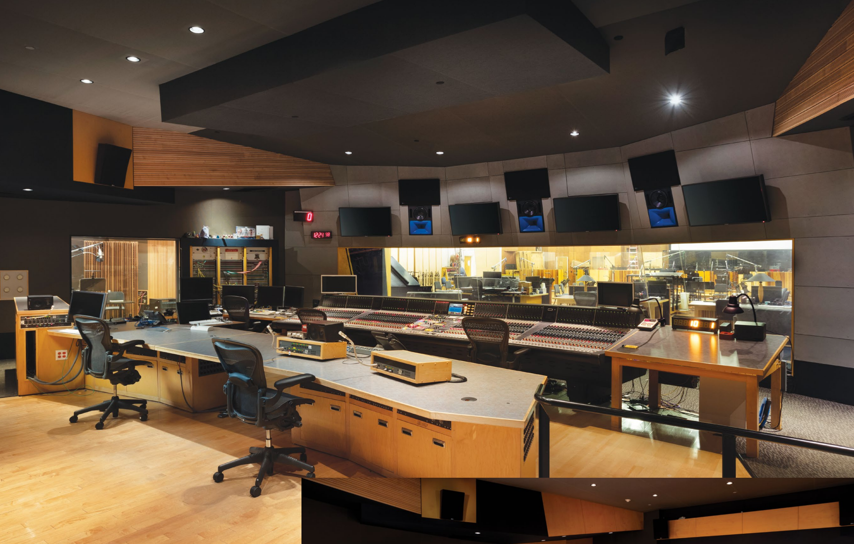
The control room in the Fox Scoring Stage updated its monitoring system after 20 years, installing a Meyer Sound Bluehorn system.