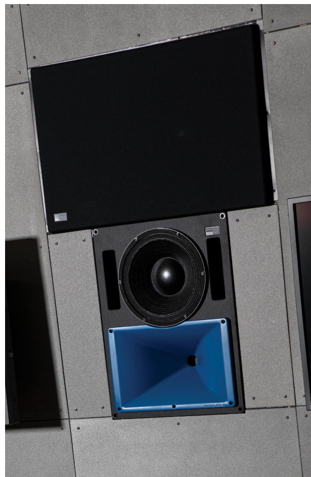
Detail of the Meyer Sound Bluehorn center channel.