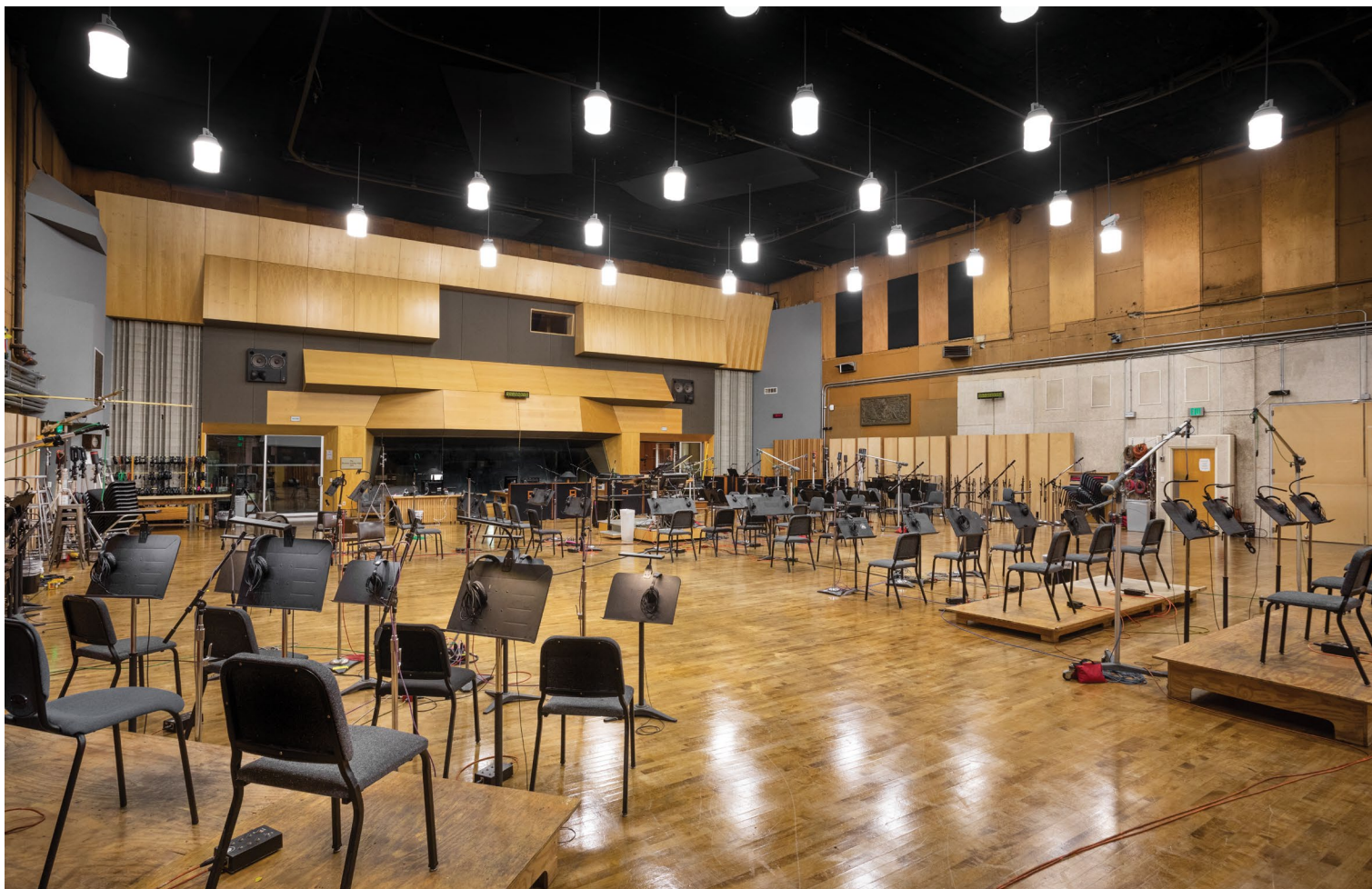
The classic stage itself remained untouched.

the ICON, D-Command and D-Control stampede through Hollywood. He established a vast network of relationships, which serves him well to this day.